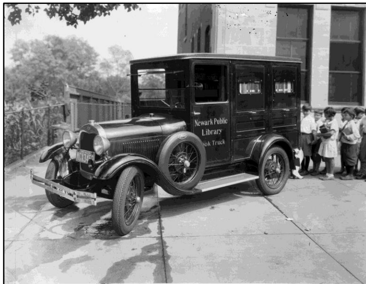
The Newark Public Library's book truck, 1930

The exhibition will be on view in the Main Library's second floor gallery through August 30, 2014 during regular Library hours: Monday, Friday, and Saturday 9 am to 5:30 pm; Tuesday, Wednesday, and Thursday, 9 am to 8:30 pm (closed on Memorial Day, Independence Day, and every Sunday). For more information or to arrange a group tour, please call (973) 733-7779.