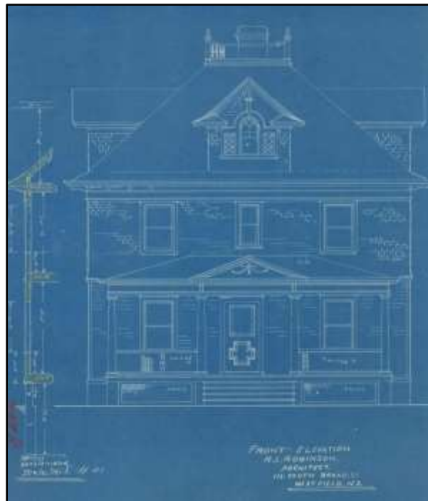
Four-Square House Elevation, Robert L. Robinson, architect, 1905.

able to show many other beautiful, historical examples due to size and space limitations. When possible, we have displayed floor plans along with elevations to present the most complete example of a particular structure. In all cases, the actual prints are on display. We have used archival-quality frames and mats with UV-filtered glass in the frames to offer the most protection possible from light and air pollution.