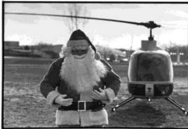
Santa Arriving by Helicopter, Red Bank, December 15, 1979, Monmouth County Archives.

In February 2009, The Courier News donated 67,000 photographs and negatives covering the years from the 1890s-2000s to the Library. The majority of the collection dates from the 1950s into the 2000s. Processing has been ongoing since 2009 and was made possible through the grant funding of two part-time archivists and several volunteers. It took five years to process approximately 32,000 35mm color film negatives. Each frame is housed in an archival sleeve with an image identification slip. Work included the cleaning, labeling, and cataloging of each negative, as well as some digitization. All were added into the library's online collections browser for public access. The project will continue with the photographic prints portion of the collection.