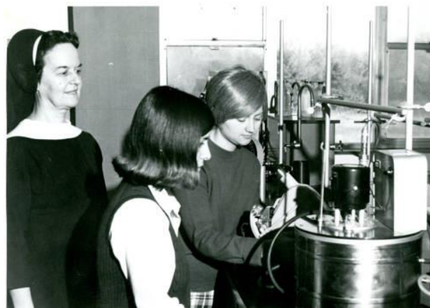
1971 Senior Chemistry Majors