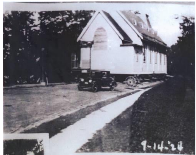
1924 St. Mary of the Lake Church – Relocation,”

description helpfully included with the photo explains that this is the St. Mary of the Lake Church, which was donated to Georgian Court by the pastor after the school's relocation to Lakewood that same year. Moving the church took two weeks to complete and required ten teams of horses to pull it to its new spot on campus. Students today know this building as the McAuley Heritage Center. Looking at the chapel now, you would never guess that it had ever been anywhere else.