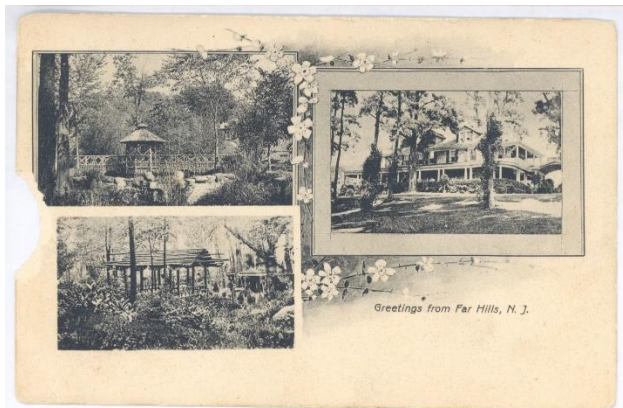
Postcard views of the Schley Estate, 1900

In the same year as the referendum in November 1921, the Essex Fox Hounds Race Meeting moved to Froh-Heim. More than 2,000 people turned out to see the fourth running of the New Jersey Hunt Cup Race despite the rain. The Far Hills Race Meeting is still held annually at this site now known as Moorland Farms. It celebrated its 100th anniversary last year, too.