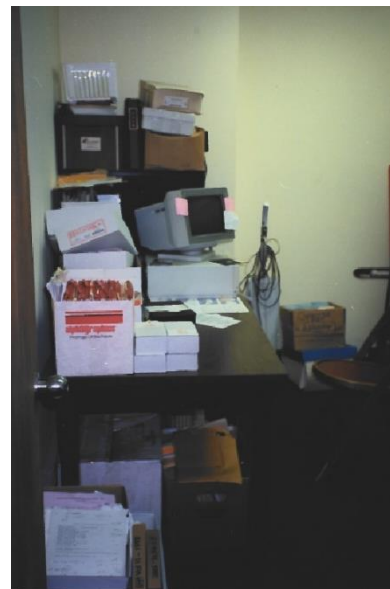
History files at the NJLA offices in 1996

The report was submitted to the Association and while small efforts were made, little was accomplished to organize and preserve the Association's archives. 1