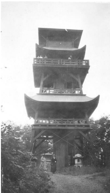
Schleys' Japanese Tower on top of Schley Mountain, 1925