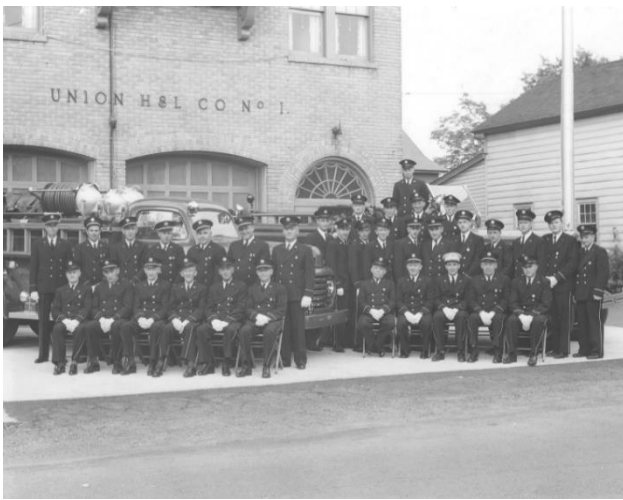
The Union Hook and Ladder Company in 1951

The village of Far Hills grew up surrounding the train station. These houses had central heat from coal fired furnaces and running water from hand pumping well water or water collected in cisterns. There was a clause in the sale of the lots in Far Hills village that prohibited the sale of alcoholic beverages on the premises. Automobiles showed up in 1906 and Charles Welsh installed a gasoline pump at his livery stable. Welsh Motors is still thriving as a business in Far Hills today. It is the oldest Jeep dealership in New Jersey. Electricity came in around 1910 and telephone service in 1912.