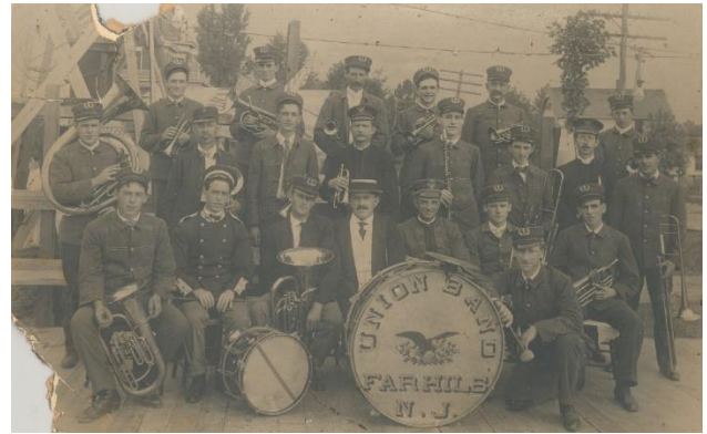
Far Hills Union Band in 1912