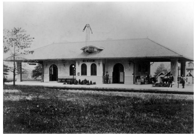
Far Hills new train station. Built in 1914, the new Spanish revival train station replaced the original station, which became a private residence.