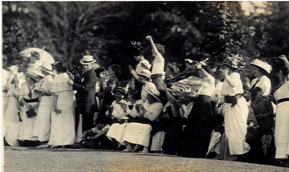
Image: Spectators cheer at a baseball game, 1913; vintage photo postcard.