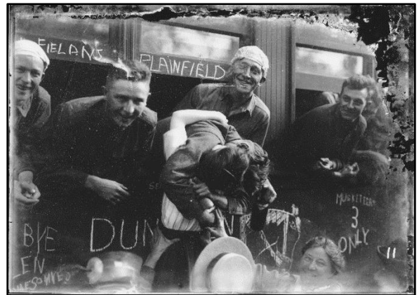
Image: Crowds send off Troop D soldiers from Dunellen and Plainfield headed for Fort Anniston, Alabama, 1917.

photographs, documents, ephemera, and newspaper advertisements. Photographs include images of Plainfield's Home Defense League and volunteer nurses, as well as Plainfield soldiers in Troop D, Company K, and the famous all-Black regiment, the Harlem Hellfighters. Four featured items come from the Library's collection of original World War I publicity posters. We are displaying these stunning lithographs in special aluminum frames with UV-filtered Acrylite and acid-free foam board backing to protect them from light and environmental contaminants while on exhibit. Funding for the special framing was provided by the