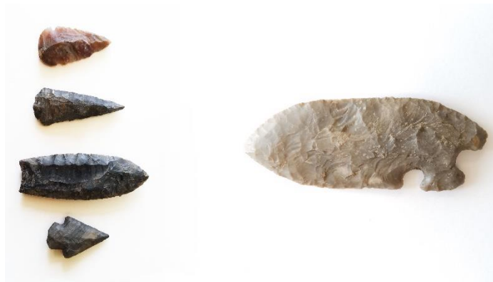
Arrowheads from the Cummins collection