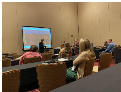
Presenters and Participants at the NJ Authors Speak Session