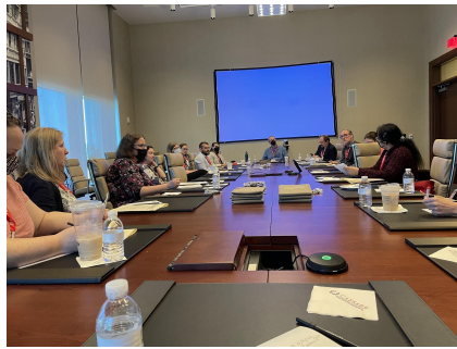
History & Preservation Section Meeting