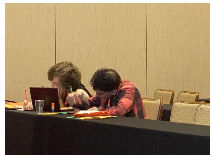
Participants at the Exhilarating Zines Session