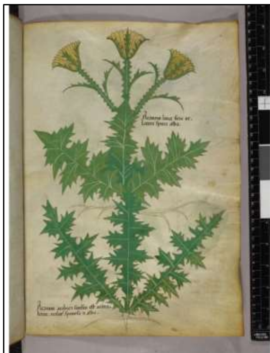
Image: Spina alba [White thistle] from Tractatus de Herbis . Barcelona, España: M. Moleiro Editor, [2011]