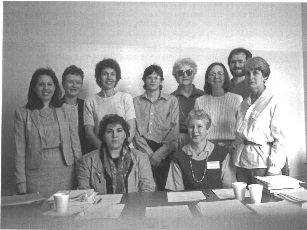
Rutgers SCILS inaugural Preservation Management Course May 19, 1989