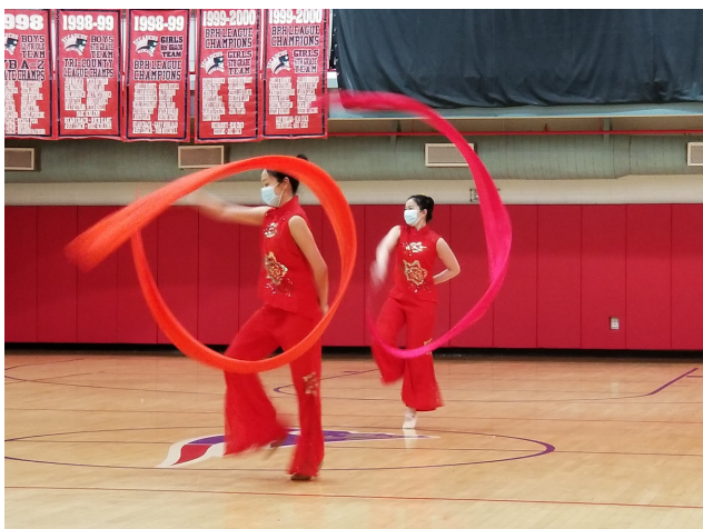
Secaucus Public Library