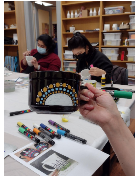
Northvale Public Library