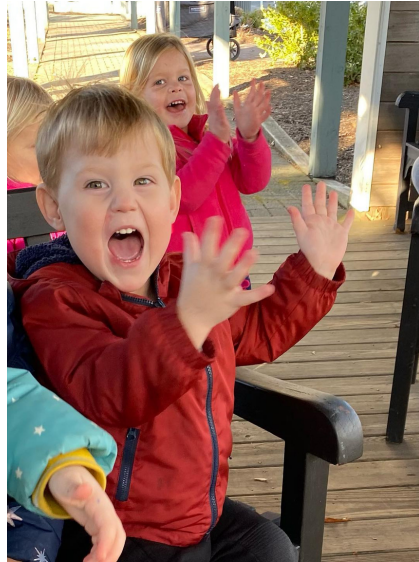
Sea Girt Public Library