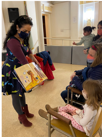
Bloomfield Public Library