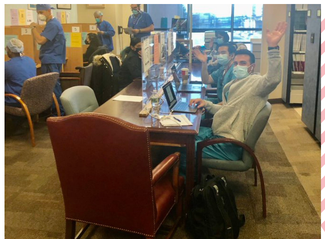
Trinitas Regional Medical Center Library