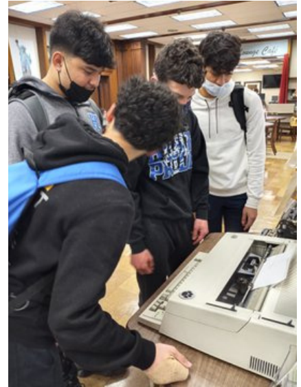
Hawthorne High School