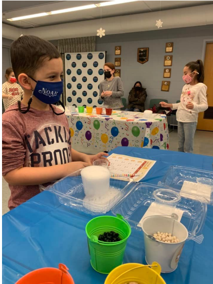
Totowa Public Library

provided by the NJLA Public Relations Committee