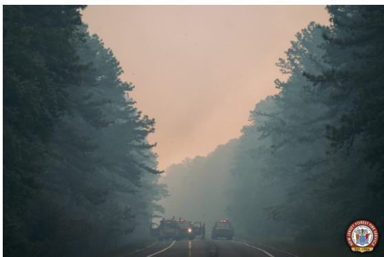
Pine Barrens wildfires closed much of the Garden State Parkway during this year’s NJLA conference. Photograph New Jersey Forest Fire Service (Facebook page).

A Code Blue alert allows at-risk people to rest in a warming center until the Code Blue ends. The warming center could be a municipal building, a senior center, a public library, or other building; they do not have to provide beds.