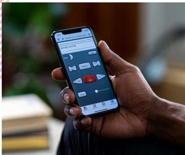
BARD Mobile App