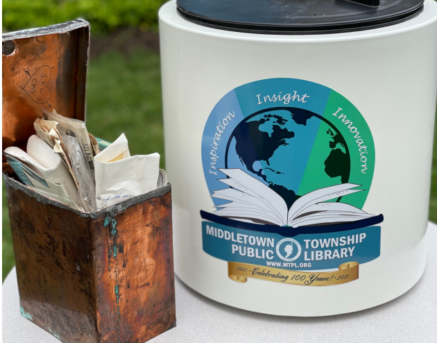
The recently opened copper time capsule from 1971 stands next to the 2021 time capsule, which will be opened in 2071.

As the Middletown community gathered in early June to kick off the 100th year since the Middletown Township Public Library's (MTPL's) 1921 founding, two time capsules forged a link between the library's past and its future.