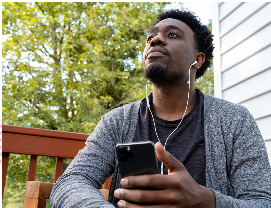
A National Library Service for the Blind and Print Disabled (NLS) patron listens to an audiobook via the BARD Mobile App on their smartphone. Learn more on page 4!