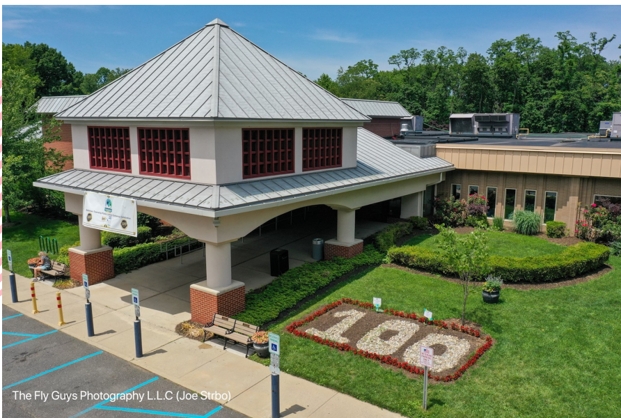
An aerial view of the Middletown Township Public Library in June of 2021.