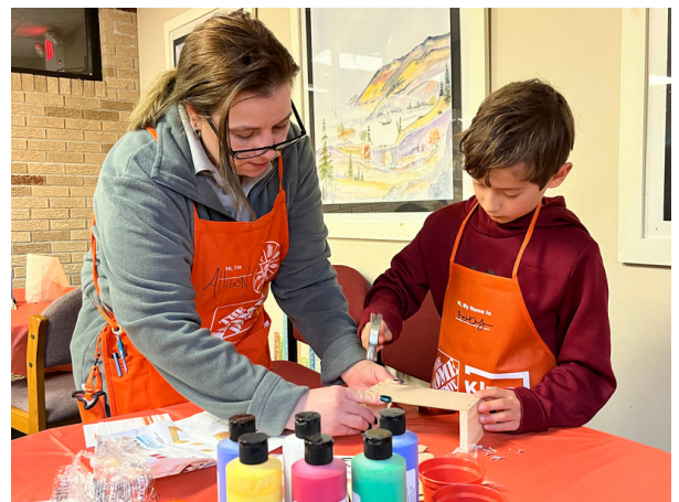
NJMD at Warren County Library

A big thank you to our sponsors, including the New Jersey STEM Pathways Network, Investors Bank, PhRMA, PSEG Foundation, LibraryLinkNJ, and Citizens Bank, without whom our mini-grant program and professional development opportunities would not be possible.