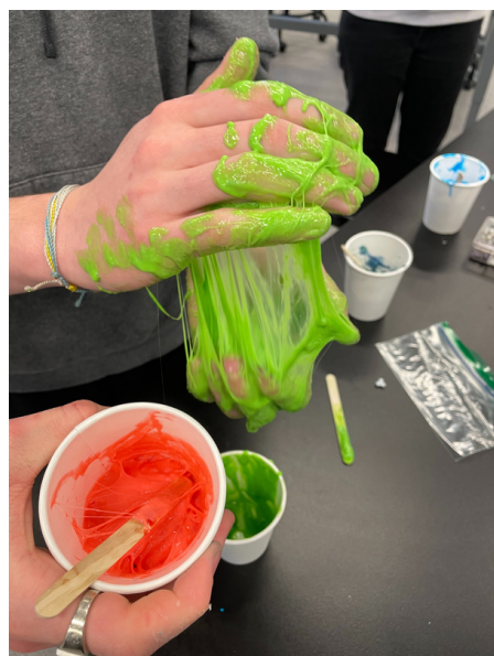
NJMD at Hunterdon Central Regional High School

These mini-grant projects ranged from a DIY mini golf course built by teen volunteers, to a day full of activities focused on STEAM for Educational Justice, to a community garden project focused on accessibility, and so much more!