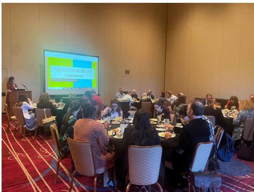
NJLA CUS/ACRL-NJ Luncheon at the 2023 NJLA Conference