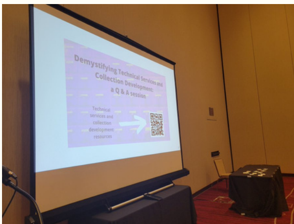
Slide with title of session and QR code to resources for attendees.

Have you ever wondered what the answers to these questions are? What do technical services and collection development do? Is technical services like IT? How does collection development decide which materials to buy for the library? How did technical services and collection development departments handle working through the pandemic? Join the Technical Services and Collection Development section for a Q&A session to find out what actually happens in these two areas. Bring your questions!